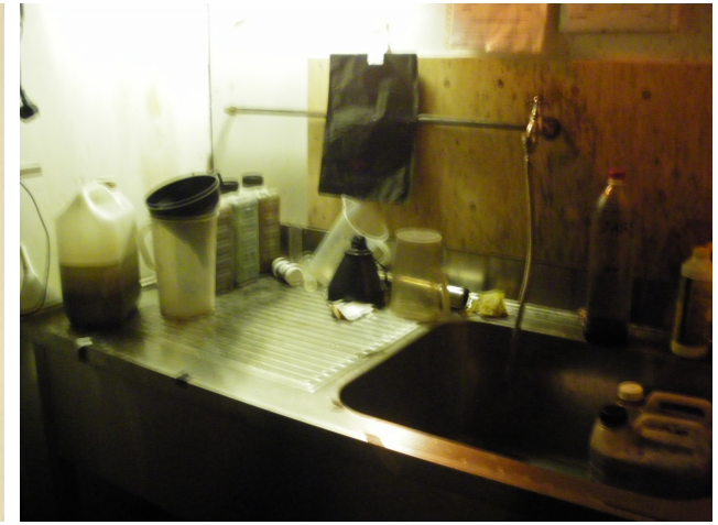
Illustration 11: typical wet area