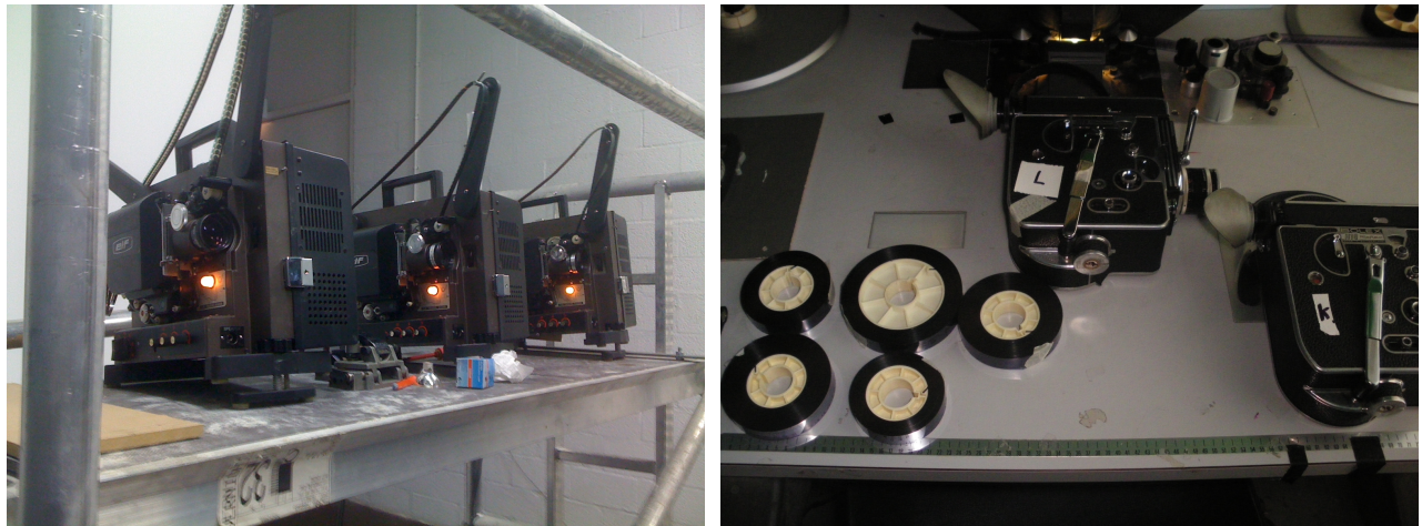
Illustration 8: 16mm rig for Artists show

A well functioning Lab for the Bristol and south west area also enables the opportunity for international visitors and residencies. As well as local and national artists there is an ever growing number of touring film workers and artists who would want to come to Bristol to make use of the facility and be involved in the space.