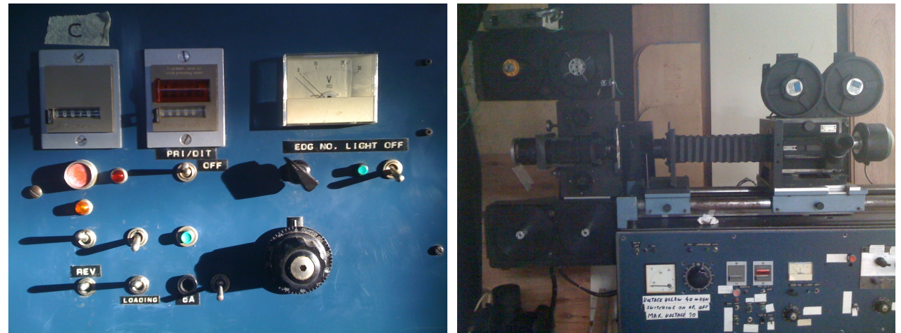
Illustration 6: Oxberry control panel

Commonly, these Labs work as member organisations whereby members pay a subscription and can use the equipment after receiving appropriate training.