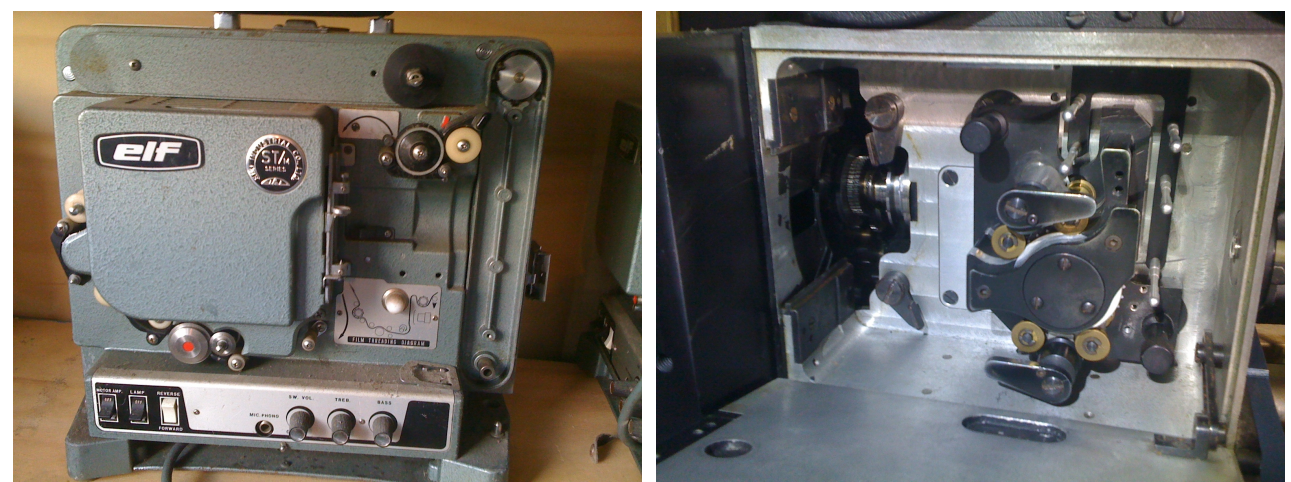
Illustration 2: 16mm projector

The Cinema industry is currently undergoing a sea-change and specialized equipment that was previously unobtainable is now going for scrap - this is to the great benefit of artisans who now have the possibility of accessing and experimenting with this technology for their own creative purposes.