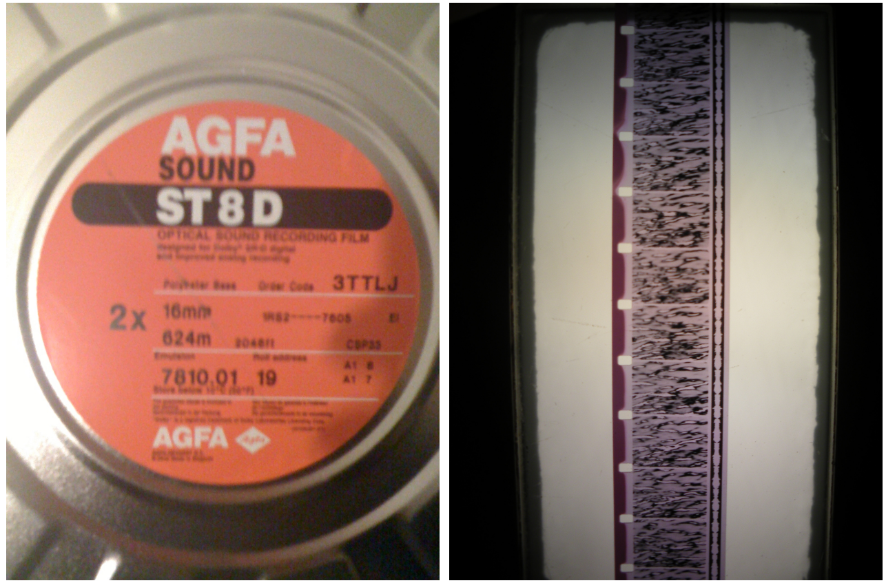
Illustration 12: agfa hi-con stock