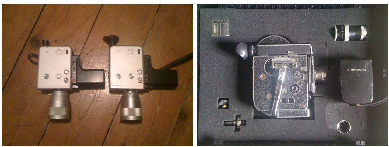
Illustration 4: super 8mm cameras

The Lab will offer the chance for anyone interested in working with motion picture film to come and learn how to shoot, develop, process, print and project.